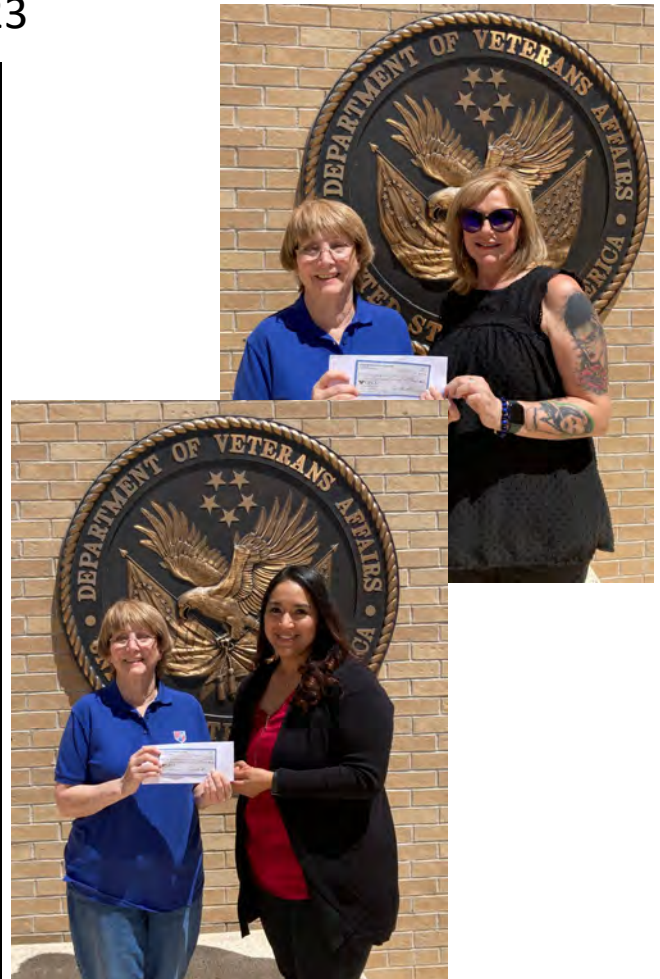
El Paso MOAA Donations to VAA2K and Baby Shower Coordinators