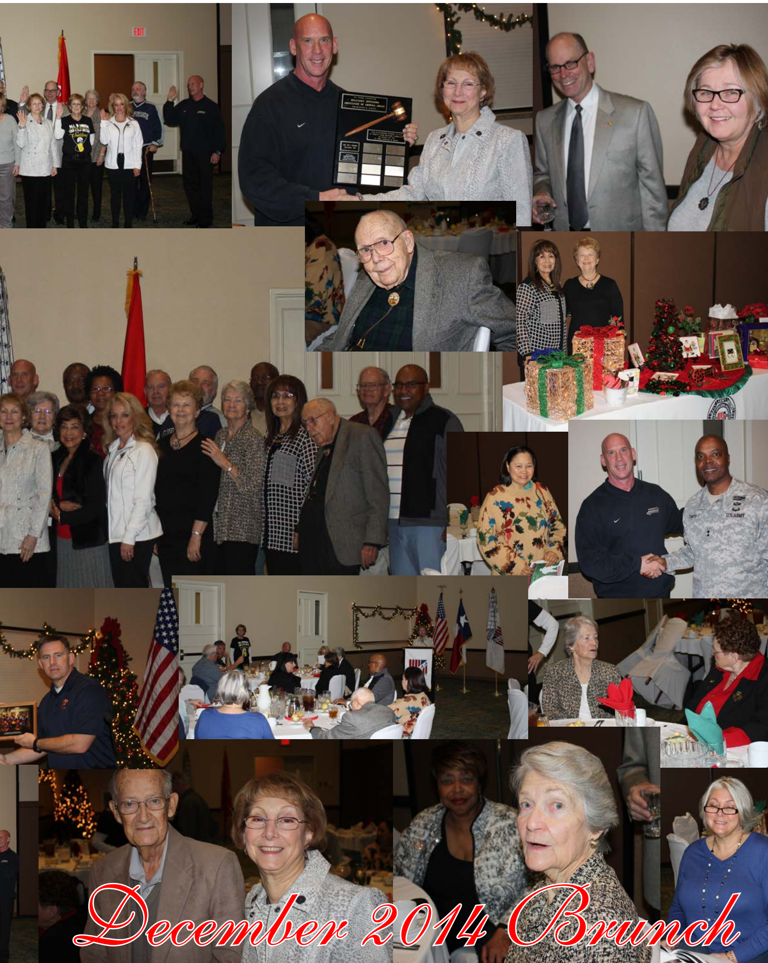
December 2014 Brunch