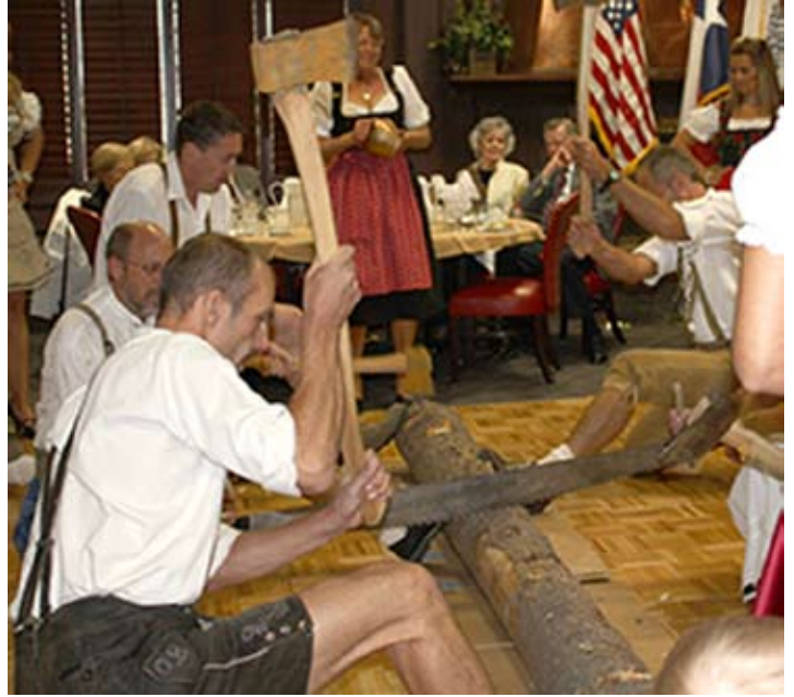
The "Schuplattler Ax Dance" at the October 2009 Luncheon.