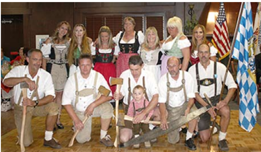
The "Schuplattler" at the October 2009 Luncheon.