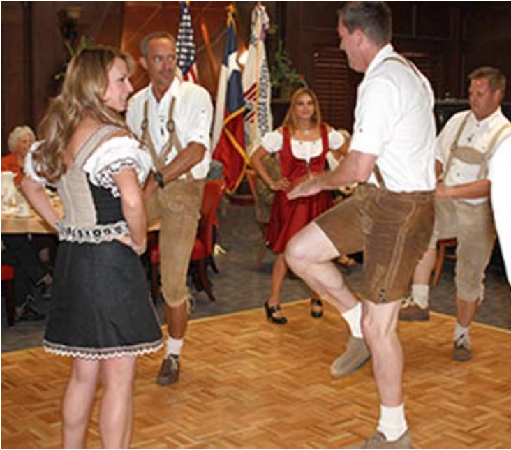
The "Schuplattler" at the October 2009 Luncheon.