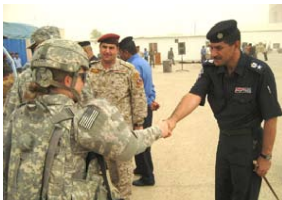
Soldiers from 4th Battalion, 6th Infantry Regiment meet with Police training academy instructors following the July 30, graduation ceremony. The battalion is deployed from Fort Bliss, Texas, to advise and assist Iraqi security forces in Maysan.